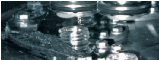
Industrial troubleshooting on a bottling line