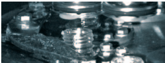
Industrial troubleshooting on a bottling line