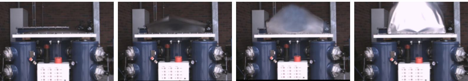
Combustion research of gas cylinders